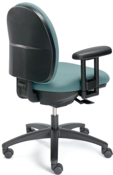
SW9820 with optional arms