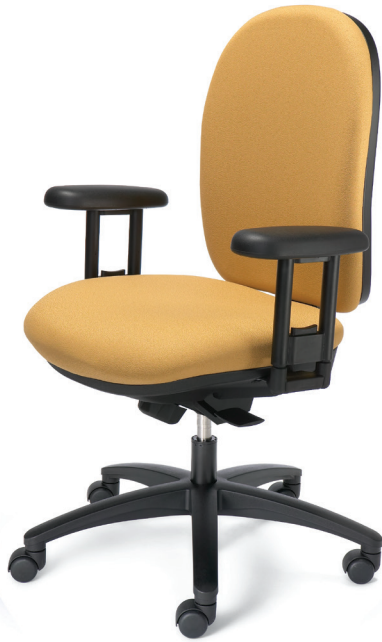
SW9840 with optional arms