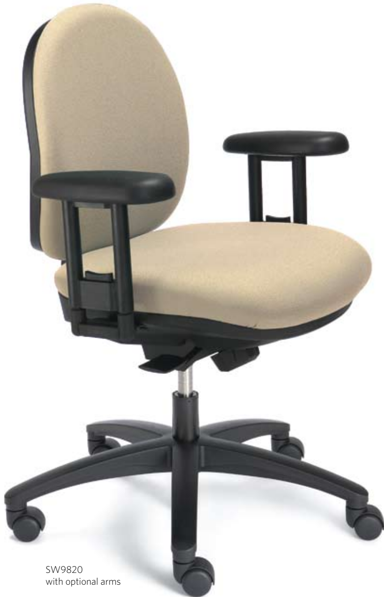
SW9820 with optional arms