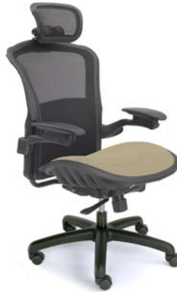
MG9982 with optional headrest