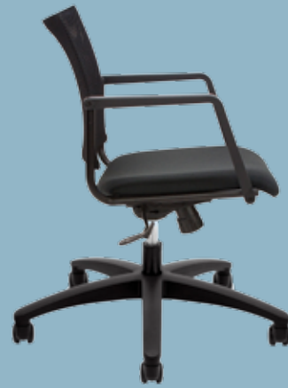
GT3405 With Optional L33 Arms