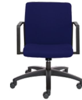
GT3406 With Optional L33 Arms