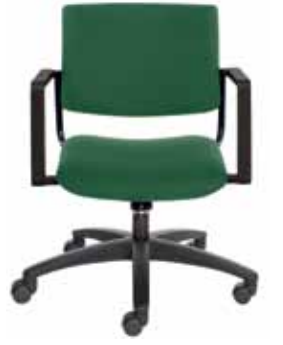
GT3404 With Optional L33 Arms