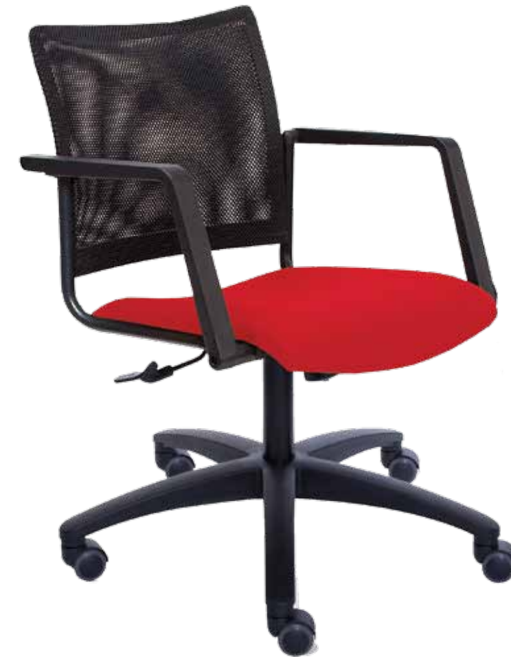
GT3405 With Optional L33 Arms

Flat top provides comfortable foot support.