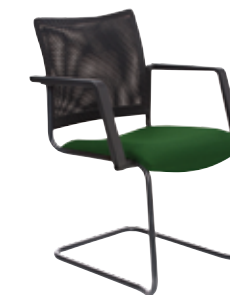
GT3105 With Optional L33 Arms