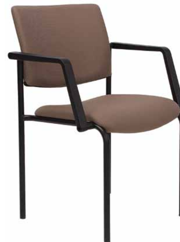
GT3004 With Optional L33 Arms

The rugged metal frame with hard cover epoxy powder-coat finish makes the Getti side chair very durable.