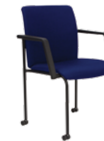
GT3076 With Optional L33 Arms