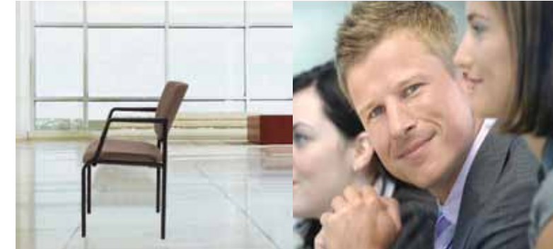
getti side chair

QuickShip is available for this product in black, navy, burgundy or gray. QuickShip product generally ships within 7 business days from receipt of order.