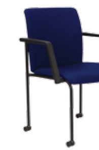
GT3076 With Optional L33 Arms